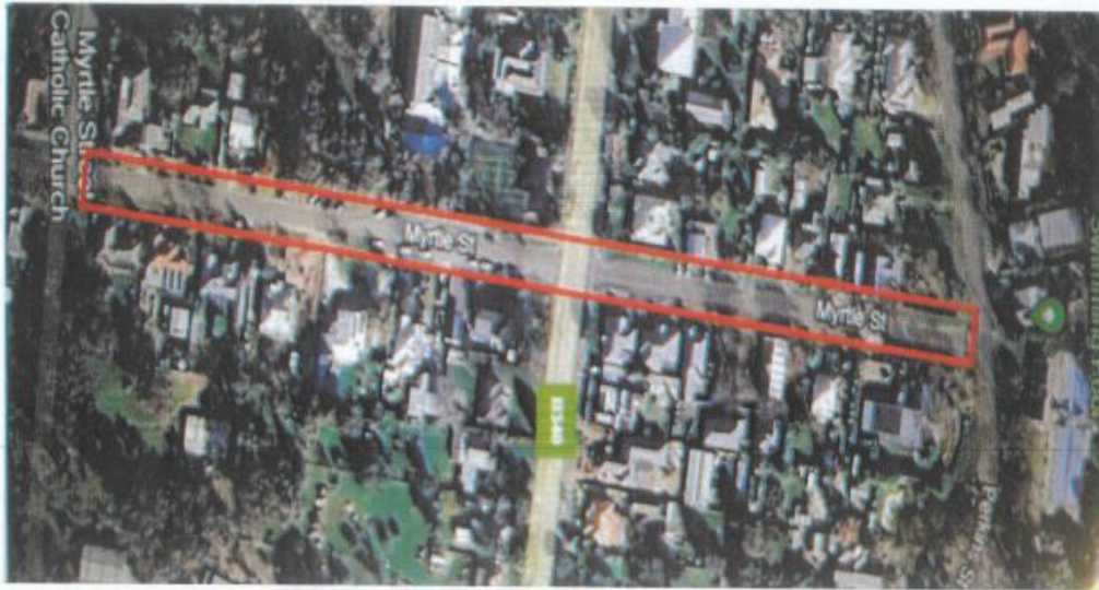
Map of affected area: