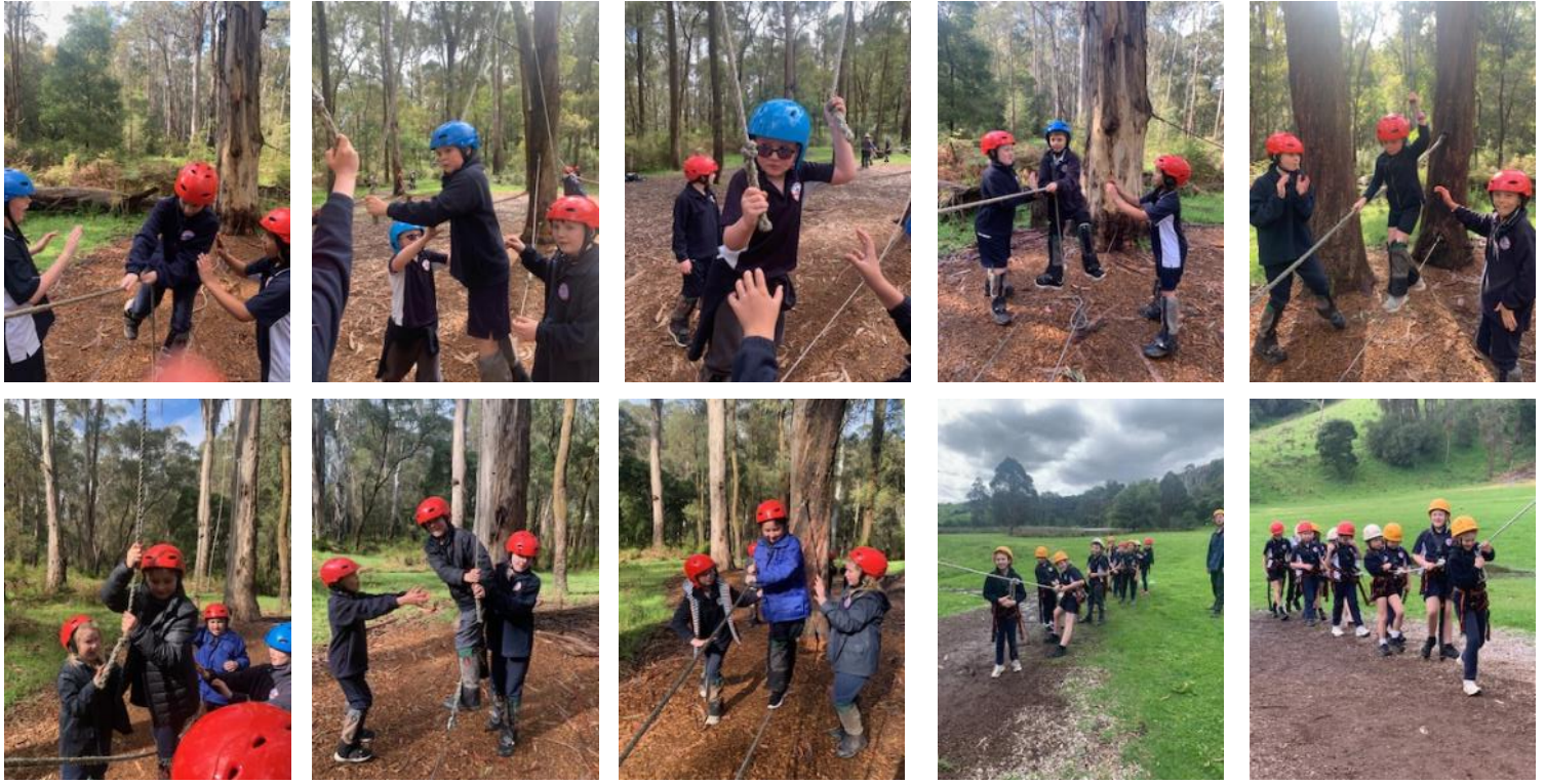
3/4 JUNGAL DAY AND FOUNDATION, 1/2 AND 5's PUFFING BILLY DAY